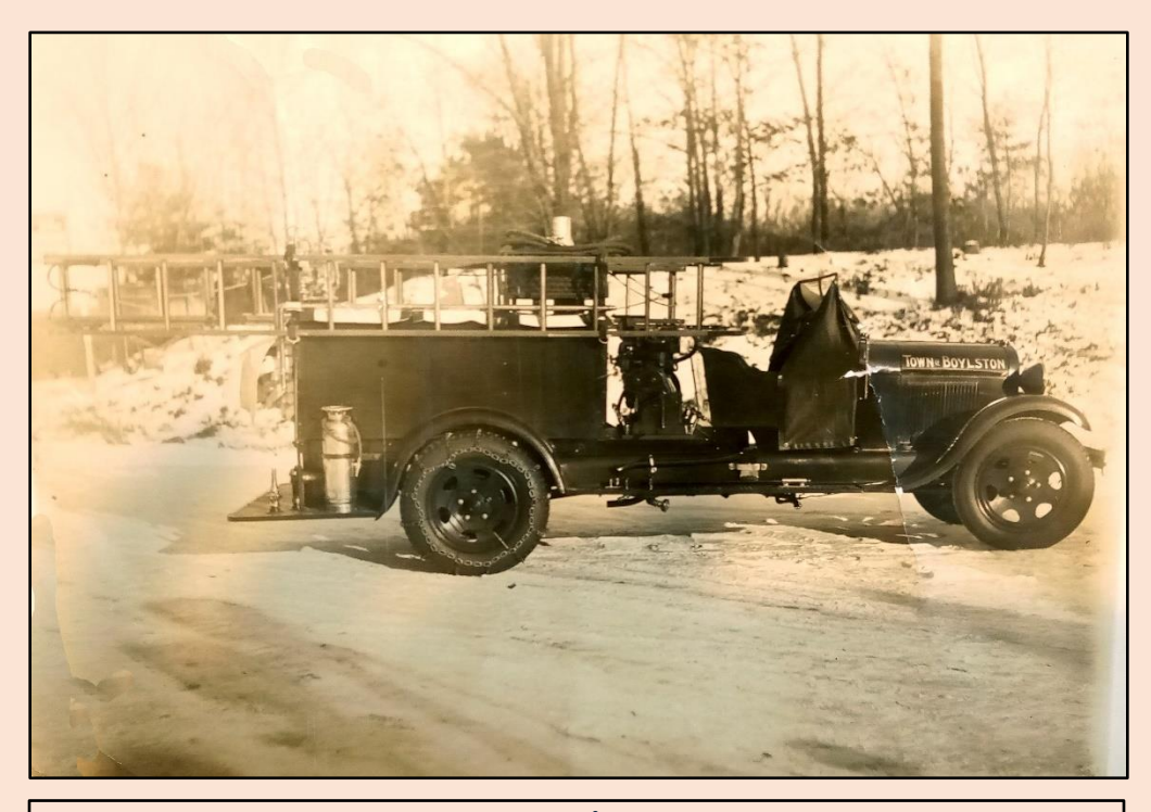
Boylston Fire Truck 1929

"The citizens' concern with fire protection finally forced the issue. The Town Meeting of 1929, voted to purchase a Ford Model A fire truck for $3,750. A Volunteer Fire Department was also created, with Thomas G. Slack as the first Fire Chief. Most of the men who had previously banded together in an unofficial Fire Brigade immediately joined the new force."<sup>7</sup>